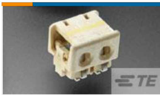
TE Part # 2-2106003-1 Connector, SMT-IDC, 1 POS, 22 AWG